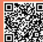
Find a Respite Provider/ARCH National Respite Network & Resource Center